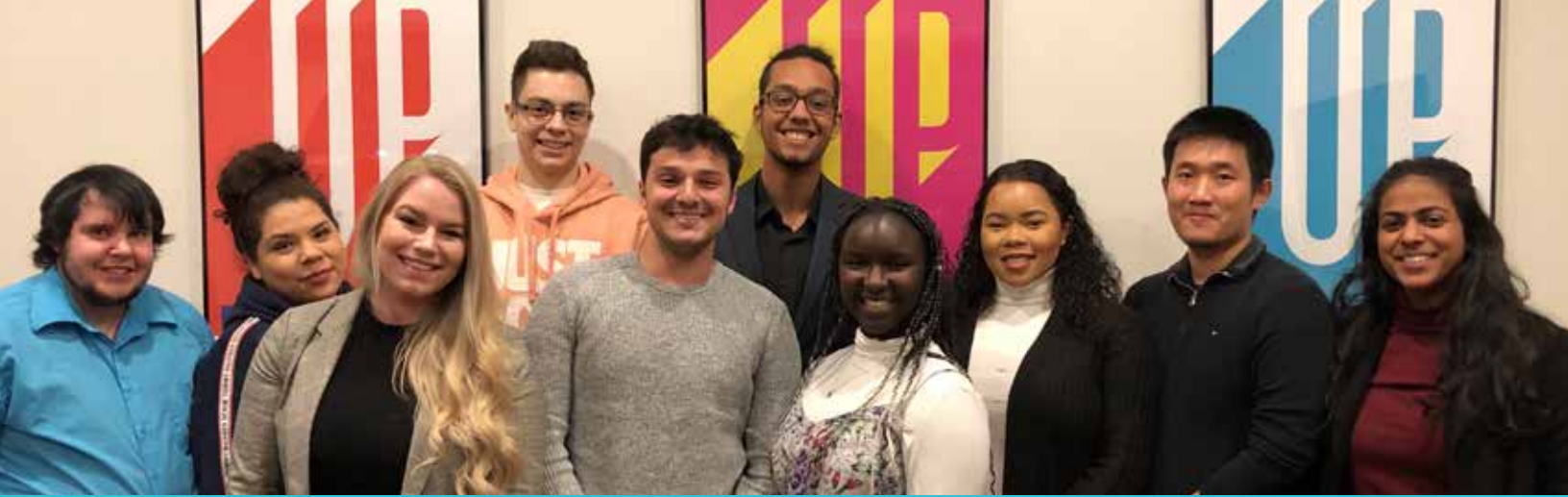
YOUNG PEOPLE'S ADVISORY COUNCIL 2019-2020

“I believe there are four words more powerful than ‘I love you,’ and those are ‘I’m here for you.’ I’m not just a client or a number; I’m a human and I need to be cared about.”