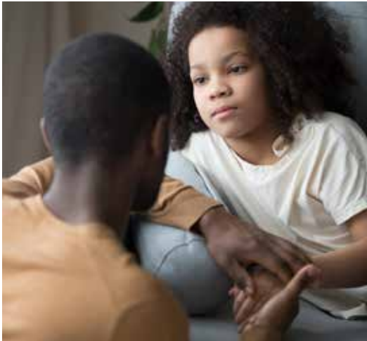
Visual identity protected

In 2019-2020, we collaborated with 14 partners to support to 3,658 kids and 1,837 families across Canada. Through programs and resources focused on preventing children and youth from entering and growing up in care, they are being helped to overcome barriers like poverty, mental health challenges, domestic violence, and substance abuse that put them at risk.