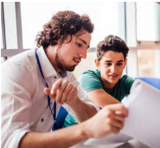
Visual identity protected

In 2019-2020, we collaborated with 44 partners to provide 9,658 kids with enrichment and education opportunities that enabled them to access sports, tutoring and other educational supports, art lessons, camp, and more to help them build confidence and motivation, connect with other young people, explore their interests, and help achieve academic success.