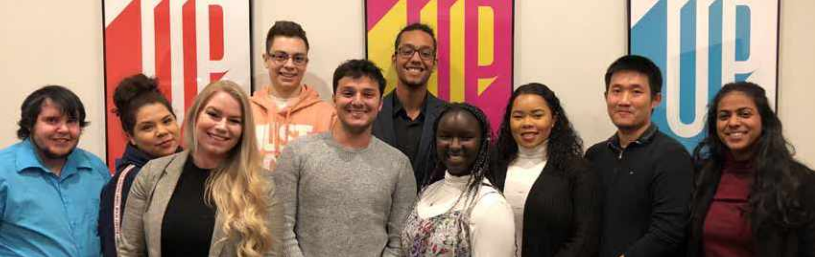
YOUNG PEOPLE'S ADVISORY COUNCIL 2019-2020

“I believe there are four words more powerful than ‘I love you,’ and those are ‘I’m here for you.’ I’m not just a client or a number; I’m a human and I need to be cared about.”